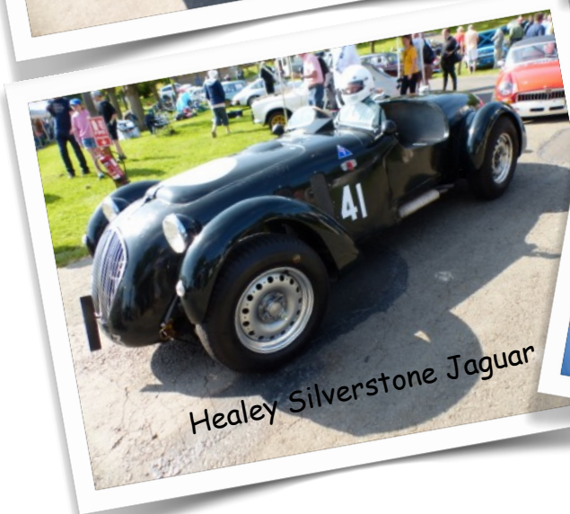
Healey Silverstone Jaguar